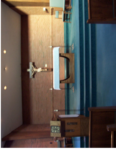
Current placement of Crucifix behind the altar